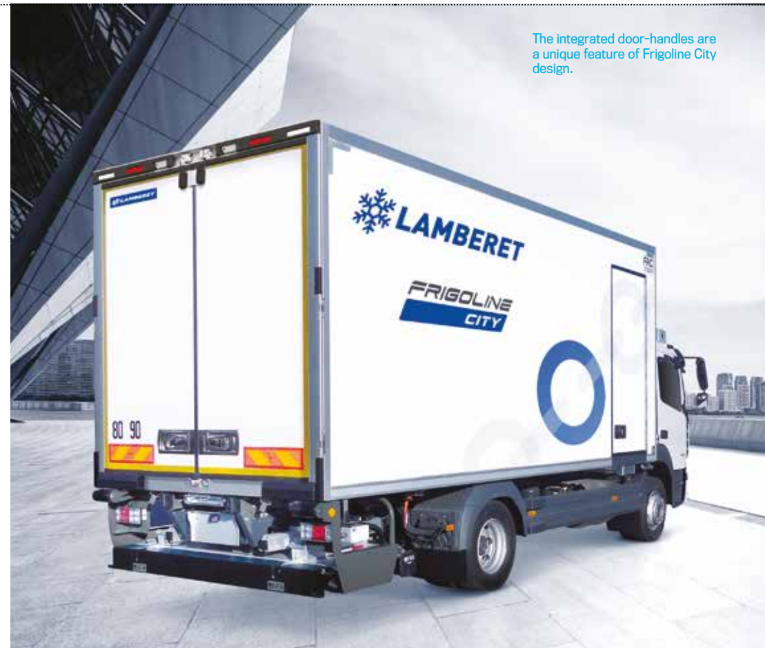
The integrated door-handles are a unique feature of Frigoline City design.

ming more burdensome. With its well-known expertise in the market for vehicles dedicated to downtown delivery, Lamberet has developed a special set of specifications for that activity. Frigoline City offers a competitive advantage when it comes to design, sturdiness, insulation, lightness, and ergonomics. Its range of dimensions and rear openings was built with last-kilometer containers and distribution best-practices in mind. ■