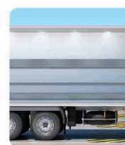
2. Dock ramp unarmored by RFID radar, unloading