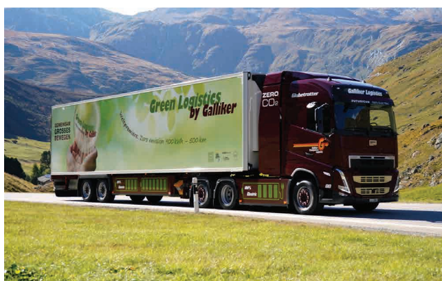
The Swiss carrier, Galliker, operates several Lamberet SR2-e trucks for the first time, including an assembly incorporating a 900 kWh Volvo Futuricum electric tractor for 100% zero emission operations.