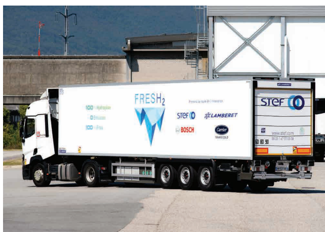
Tests in real conditions with the carrier, STEF, are conclusive: the BOSCH direct PAC H2 technology has made it possible to provide multi-temperature distribution rounds in the long-term.