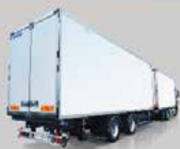
RIGIDS & TRAILERS