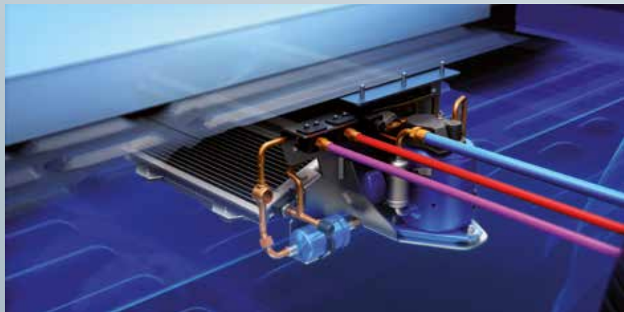
Condenser and compressor built in under chassis