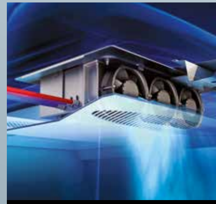
Evaporator built into insulation