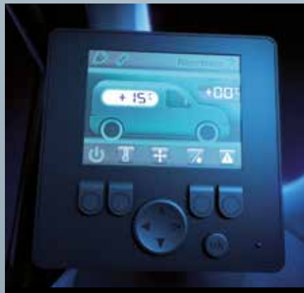
Unit control with 2.8" colour screen